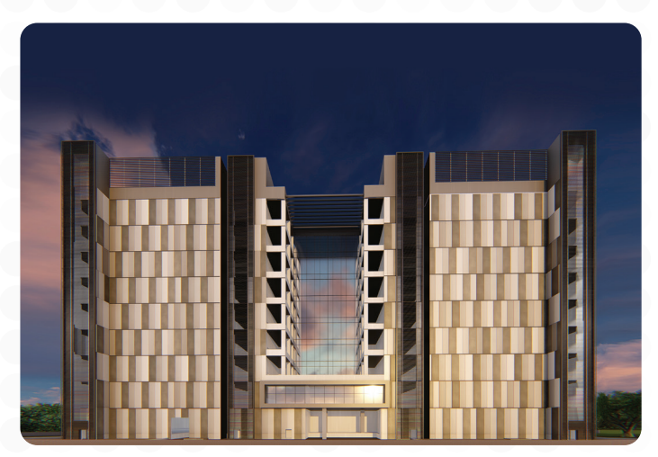
CHENNAI 02 SIRUSERI

Type: Hyperscale Data Center Campus Operational: 2023 onwards IT Power: 78 MW | Racks: 13000+