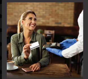
Europe's leading payment gateway provider chose Sify's Data Center