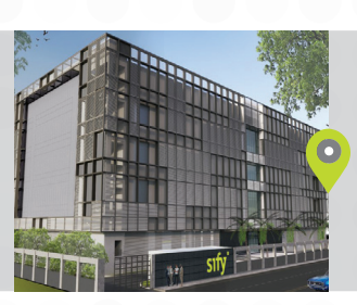
Bengaluru 02: KIADB Aerospace Park Type: Hyperscale Data Center Operational: 2025 IT Power: 20 MW | Racks: 3000+