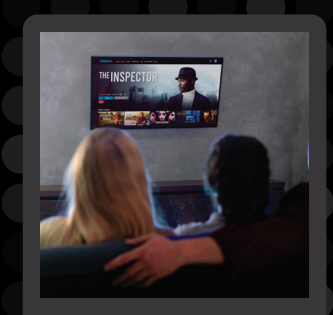
Global OTT players chose Sify's Data Center to connect to millions of subscribers