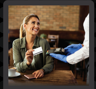
Europe's leading payment gateway provider chose Sify's Data Center