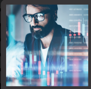
India's largest digital wallet and new-age fintechs are hosted with Sify