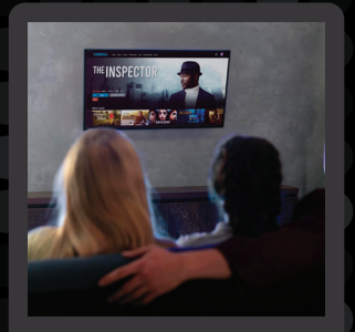
Global OTT players chose Sify's Data Center to connect to millions of subscribers